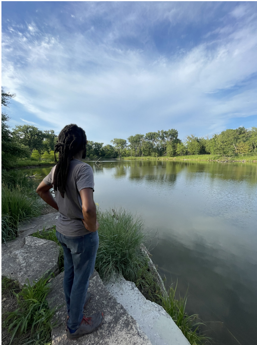
Image: Senator Simmons visiting West Ridge Nature Preserve in our district last weekend!

amazing work they do, check out their websites using the links below!