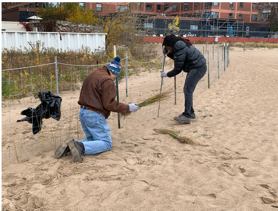
Image: Senator Simmons joins neighbors in planting marram grass on our shoreline with the Edgewater Environmental Coalition last fall