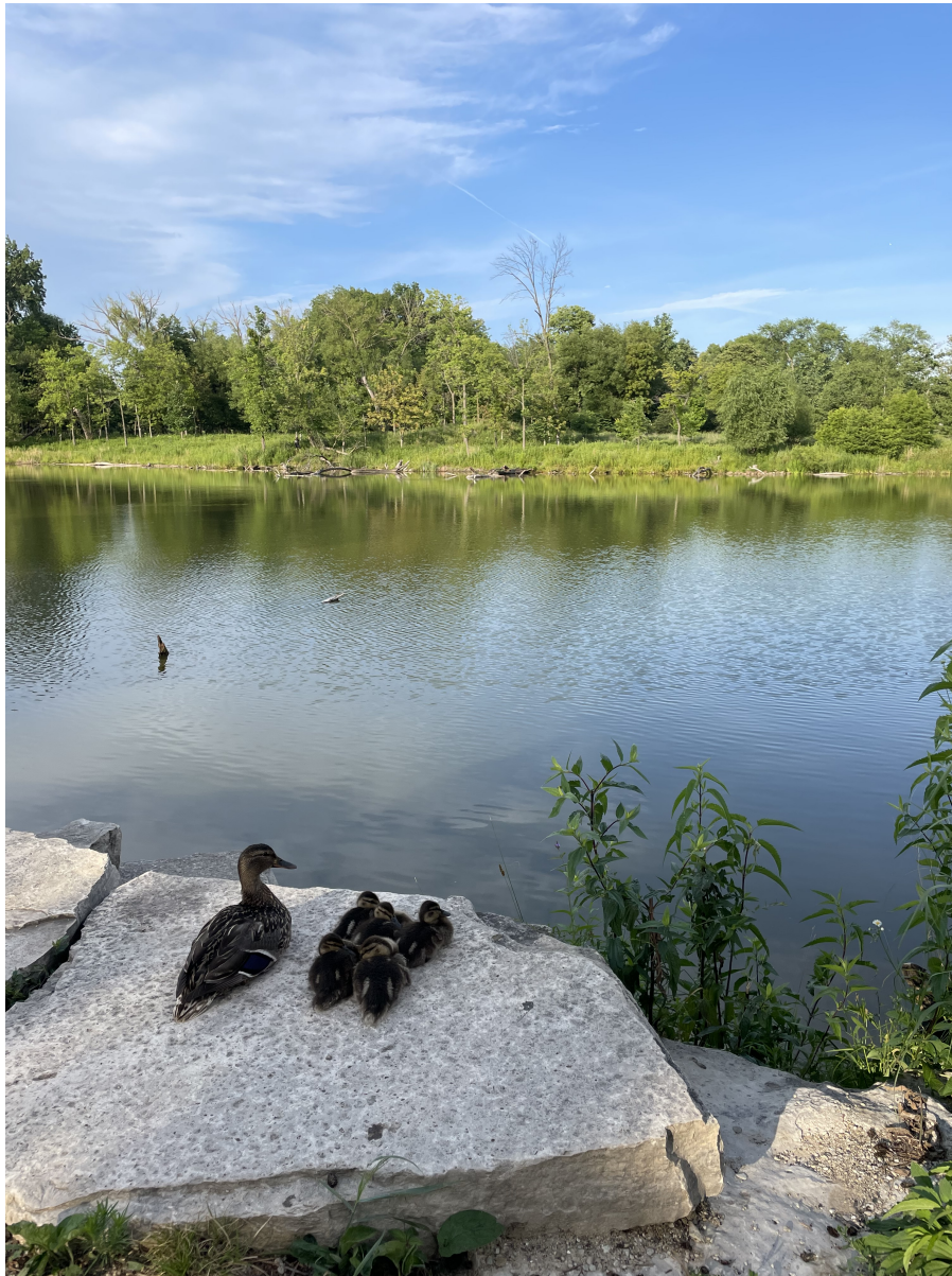
Image: Senator Simmons grabs a photo of a duck family at West Ridge Nature Preserve