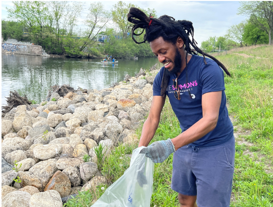
Image: Senator Simmons helping clean up the Chicago River near Foster Avenue with Friends of the Chicago River this spring!

WEBSITE | LATEST NEWS | 7TH DISTRICT | CONTACT US You can text us at: (773) 945-9979